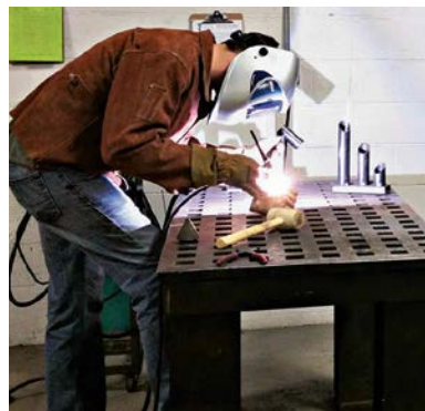
Around the country, industrial shops known as “makerspaces” are serving both professional and vocational interests, and becoming communities in their own right.

Something like this future is already present in the small but growing number of industrial shops called “makerspaces” that have popped up in the United States and around the world. The Columbus Idea Foundry is the country’s largest such space, a cavernous converted shoe factory stocked with industrial-age machinery. Several hundred members pay a monthly fee to use its arsenal of machines to make gifts and jewelry; weld, finish, and paint; play with plasma cutters and work an angle grinder; or operate a lathe with a machinist.